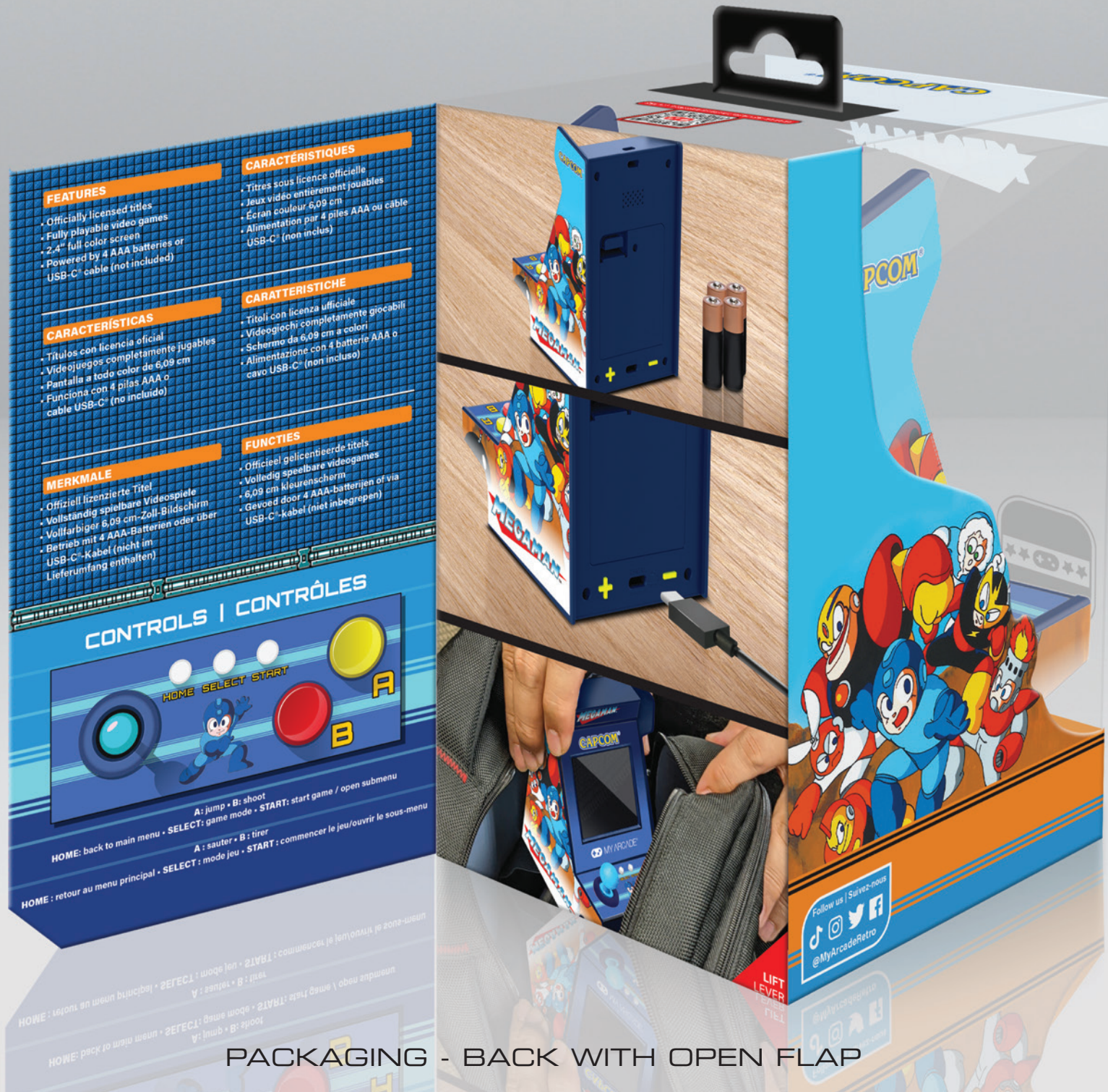
PACKAGING - BACK WITH OPEN FLAP