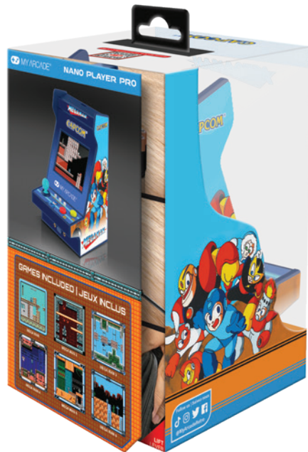
Packaging - Back