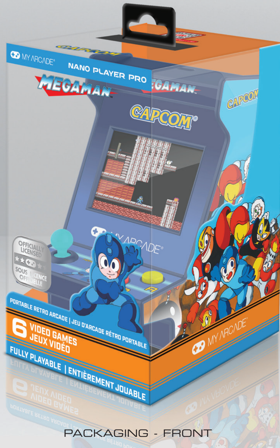
PACKAGING - FRONT