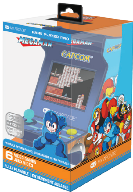
Packaging - Front