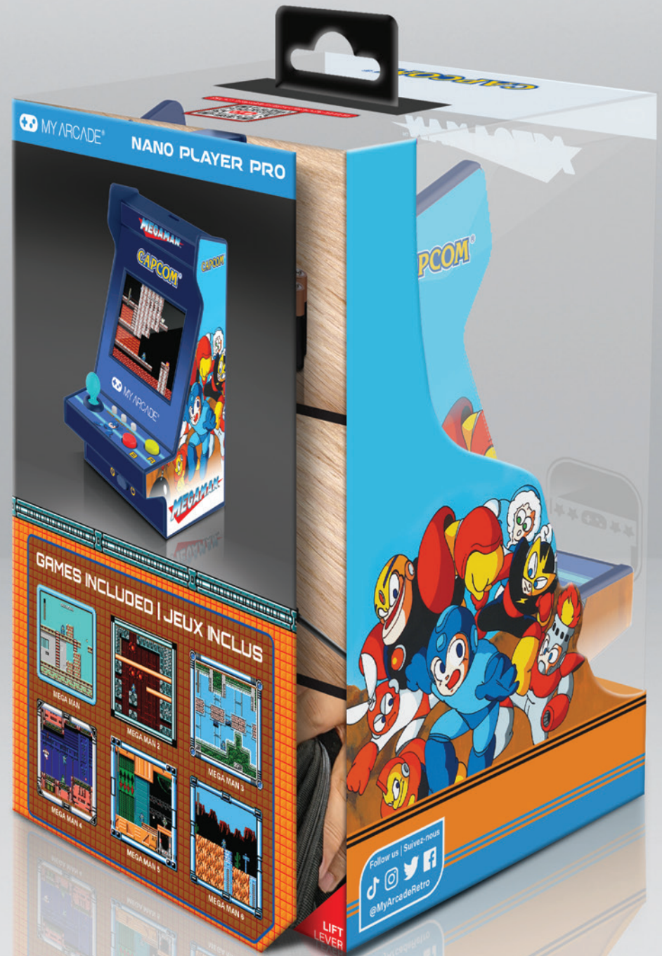
PACKAGING - BACK