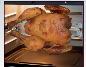
Spit for e.g. crispy grilled chicken, kebab/gyros