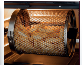
Rotating frying basket