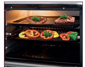
2 slide-in grilles for simultaneous prepare of different dishes