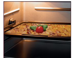
Baking tray / grease drip tray