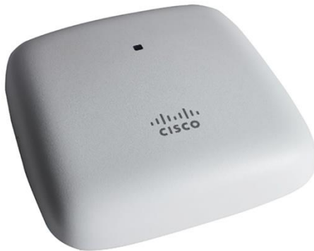
Figure 1. Cisco Aironet 1815i Access Point

The 1815i extends support to a new generation of Wi-Fi clients, such as smartphones, tablets, and high-performance laptops that have integrated 802.11ac Wave 1 or Wave 2 support.