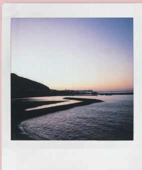
instax mini (86 x 54 mm)