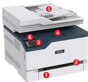
Xerox® C235 Colour Multifunction Printer