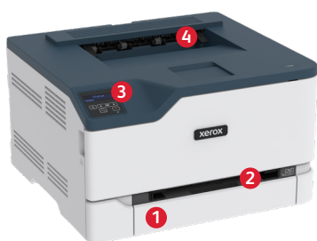
Xerox® C230 Colour Printer